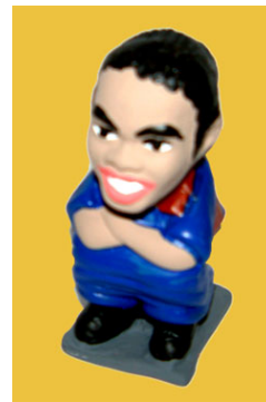
The Ronaldinho caganer