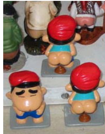
Typical caganers .

More info: About the funny and traditional caganer: www.caganer.com or http://www.amicsdelcaganer.org/