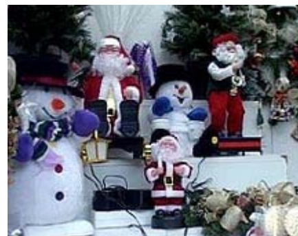
A traditional stall