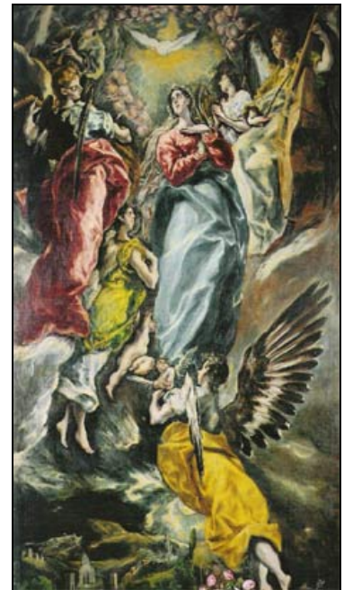
The Inmaculate Conception, by El Greco

Please note: Although it is a bank holiday, most shops will be open on December 6 th and 8 th .