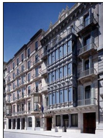
Picture of the hotel

IMPORTANT: The deadline to sign up for it is next Monday . REMEMBER: Just write your name on the list you will find on the first floor of IES1, on the front desk.